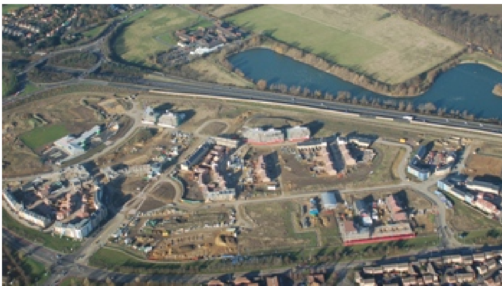
Aerial view of Arbury Park (2007)