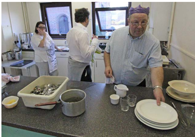
Sunday Lunch Club Christmas Dinner