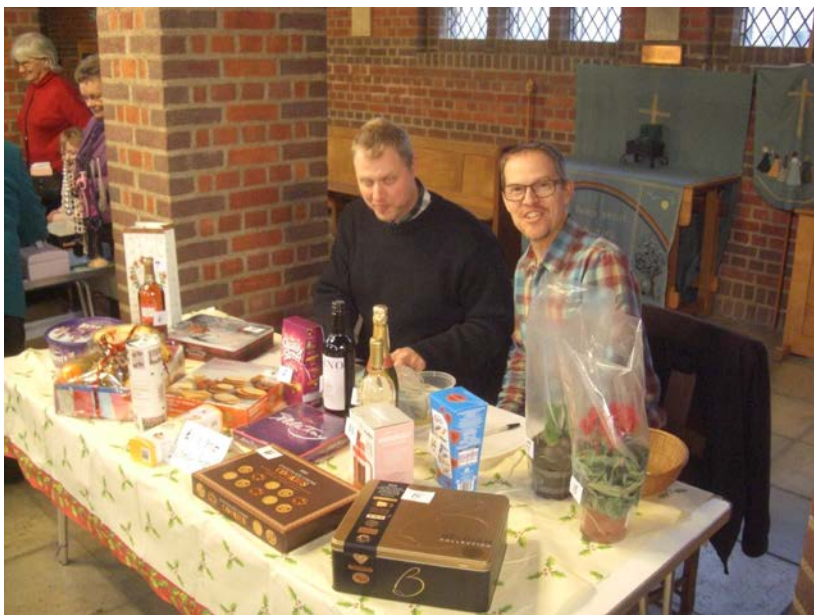
Christmas Market 2013