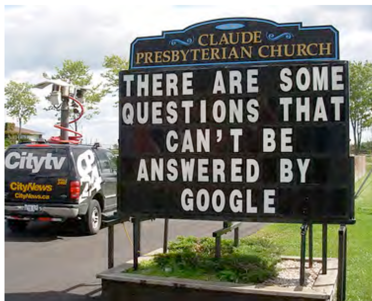
Thanks to Terry for the picture jokes